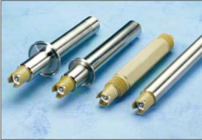
Sensor Mounting Configurations